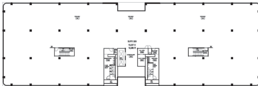
Fifth Floor, Building Two

Contact: Gary Roberson or Rob Geiger 412-391-2600